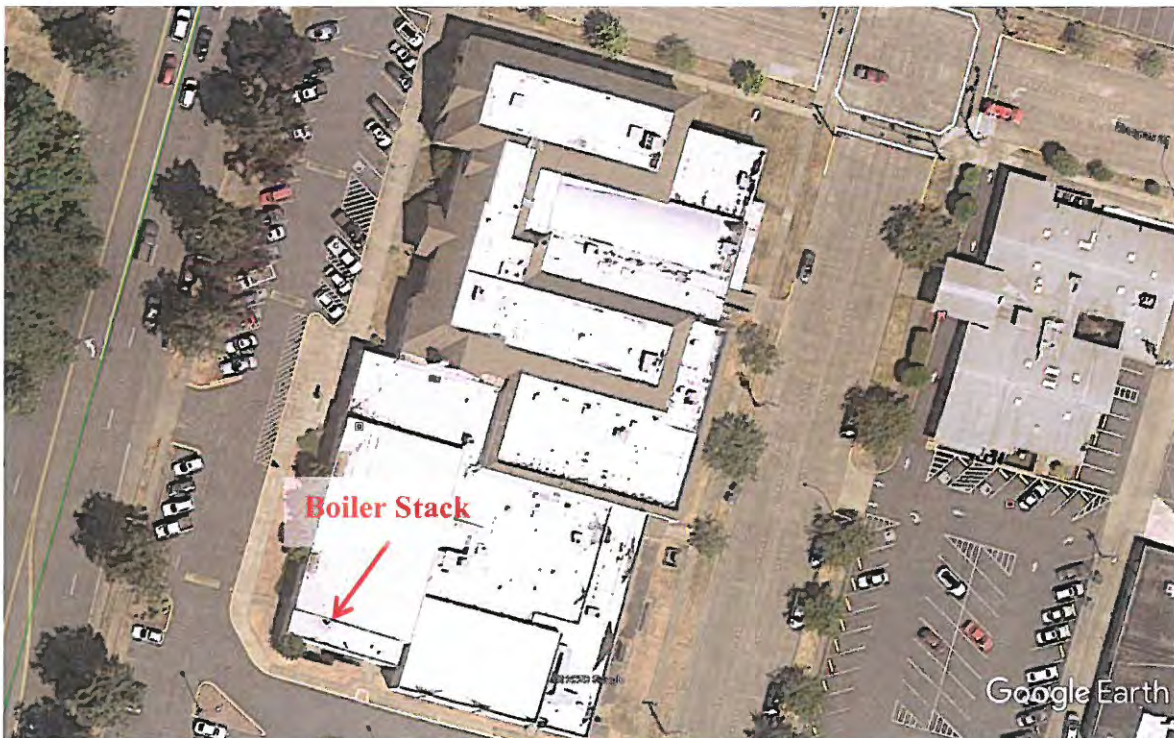
Google Earth Image – July 15, 2019

Boiler Identification: Pool Boiler Location: Aquatics Basement Boiler Make/Model: Advanced Thermal Hydronics / KN-16 Boiler Description: Condensing boiler with pre-mix metal fiber burner. This boiler meets SCAQMD Rule 1146.2 standards Turndown Ratio: 5:1 Serial Number: 10185426 Installed: Installation completed April 2019 Built: October 2018 Heat Input Rating: 1.600 MMBtu/hr Fuel: Natural gas Stack Description: ~6" diameter, exhausting vertically above the building roof ~7' above the lower roof, and 22' above ground level through a capped stack. Near the southwest corner of the building. ~ 46° 7'40.60"N, 122°56'25.01"W